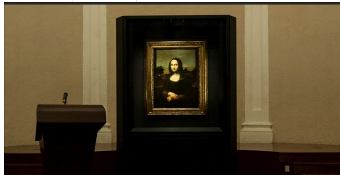
The "Earlier Mona Lisa" exhibit.